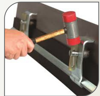
Skirt Rubber Fitting