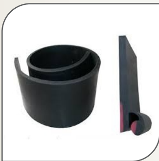
As per ASTM D412